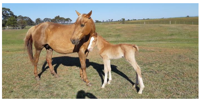
3% of her bodyweight daily in milk production so, for example, a mare of 454kg will produce in the region of 13.6kgs of milk per day.

Once the mare has foaled and is lactating, her energy requirements will increase by as much as 44% and nutrients, such as protein, calcium, phosphorous and vitamin A, will be in particularly high demand. With the foal growing most rapidly during the first three months, the mare will give up to for example, a mare of 454kg will